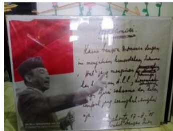
Figure 2 Student Proclamation Text Work

The picture above is the creativity of students in making teaching aids or science learning media to make it easier to accept and understand science lessons. The active, creative, effective and fun dimensions can be seen in the media made by students. Social studies subject educators apply media or teaching aids in accordance with the ACEJL learning model that is adapted to the material to be taught, for example through stories that are presented and pictures as the stimulus presented. Students in social studies subjects implement the ACEJL learning model by making works as a form of actualization in social studies learning. Figure 2 shows the results of this work.