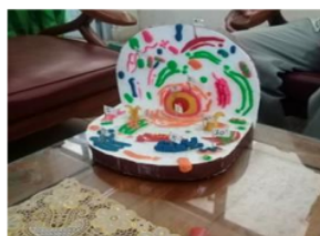
Picture. 3 Human Nerve Cells in Science Learning

Media or props that support ACEJL in it should be able to strengthen the four dimensions of being active, creative, effective and fun. Science subject educators stated that they had used supporting media. It can be seen in Figure 3.