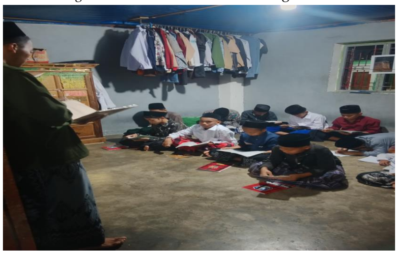
Figure 2. Bandongan Activities in Islamic Boarding School of Darul Huda

From the discussion above, the researcher can conclude that in the context of implementing the learning method, it is very dependent on the type of subject being taught. So that by using more than one method in each subject, it is rooted in the principles of comprehensive and holistic Islamic education. Islamic learning in general can be done through the latest approaches and methods, such as discussion, problem solving, and team-based learning (Arifai, 2018; Ja'far, 2022; Siringoringo et al., 2024). The sorogan method, bandongan, Demonstration/practice of worship method, deliberation method of bahtsul masa'il and muhafazhah or memorization method, are the main choices, considering that the Darul Huda Islamic boarding school is categorized as a traditional Islamic boarding school or often referred to as salafiyah which has a distinctive learning style and tradition.