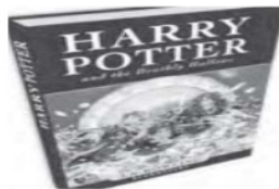
English in Focus VII