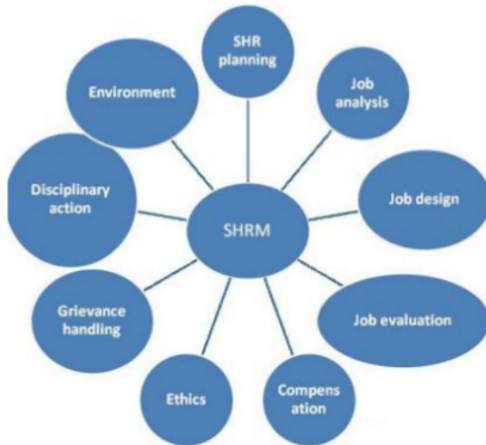
Figure 3: SHRM sources