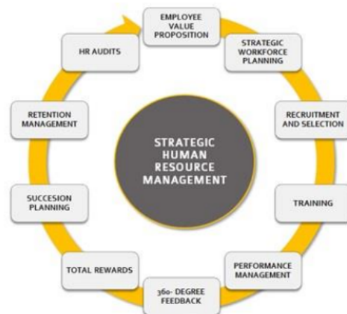
Figure 1: Strategic human resource management

At the point when a human resource department builds up its arrangements for training, compensation, and recruitment on the objectives of the association, it is guaranteeing a more noteworthy possibility of authoritative achievement. How about we consider this methodology in connection to a ball game, where Player A is the vital HR office, and Players B through E are different divisions inside the association.