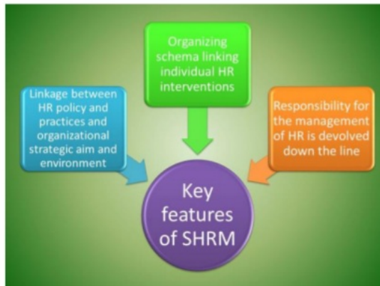
Figure 4: Key features of SHRM